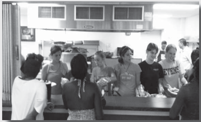
IPC Youth serving dinner at First Light