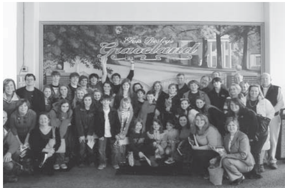
The IPC Westminster and Te Deum Choirs and chaperones in Memphis

services, Epiphany Procession, Lenten Prayer Service, Youth Sunday and their annual tour to various Retirement facilities in Birmingham.