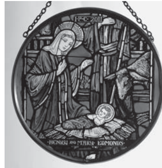
Hand painted, full color Roundel

NEW OPPORTUNITY THIS YEAR! In celebration of the upcoming centennial celebration of IPC in 2015, the choir is selling roundels of the stained glass found throughout the church. There will be 5 different roundels-- all hand painted, one released each year until 2015 . The inaugural piece is of the Nativity Window in the sanctuary. These treasures cost $45.00 each; additional $5.00 shipping charge per item. CDs and roundels are available for purchase at www.ipc-usa.org or from the music office at the church. Questions? Call the Music Office at 205-933-3700, or e-mail bfillmer@ipc-usa.org